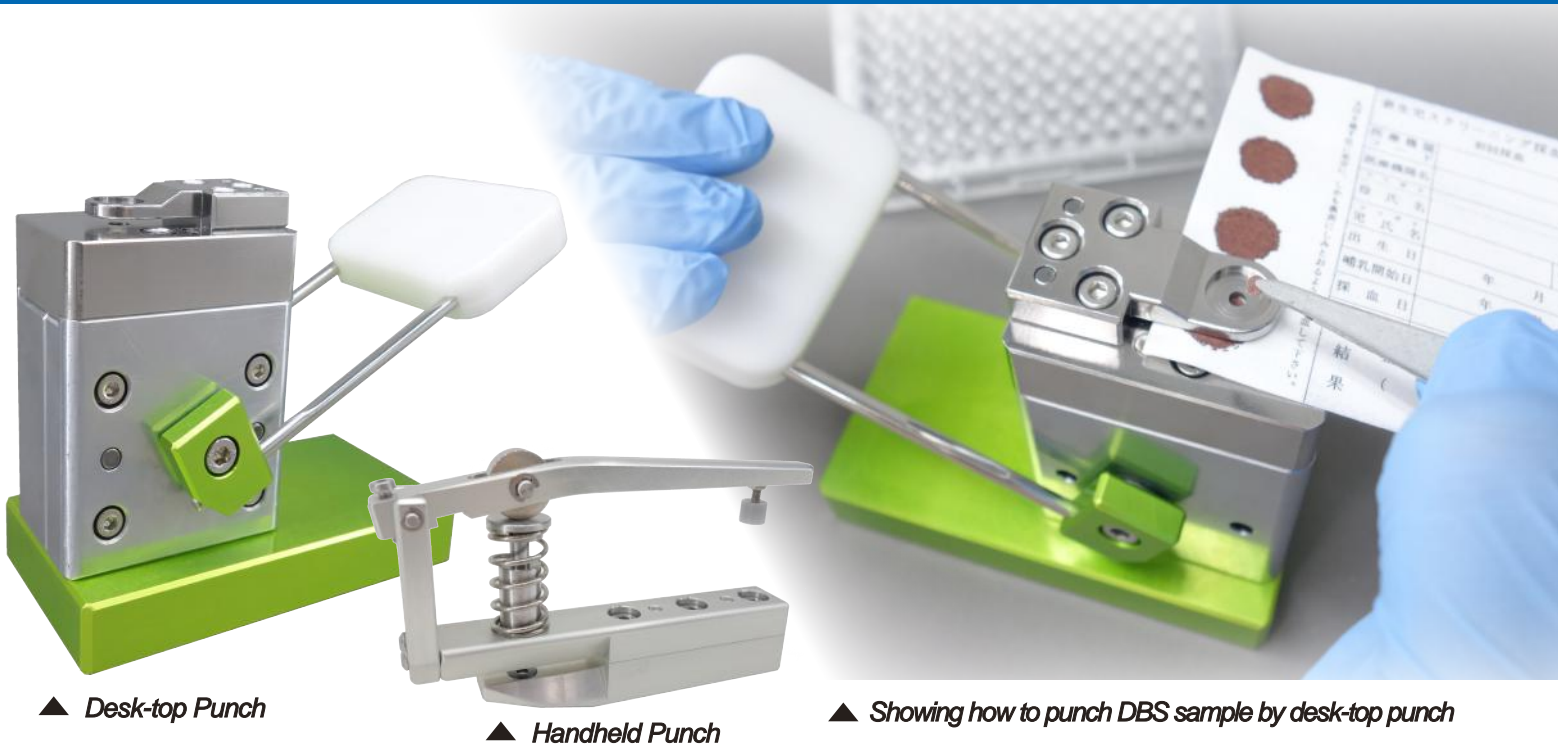
▲ Desk-top Punch